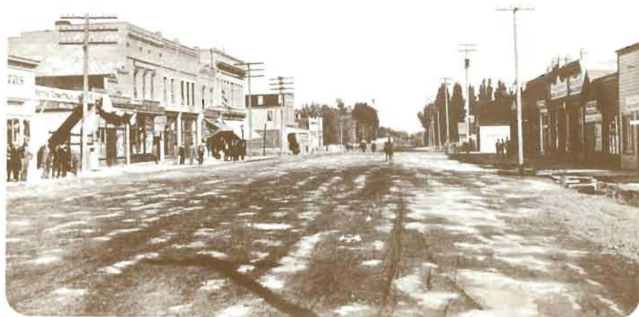
Vernal, Utah, Main Street