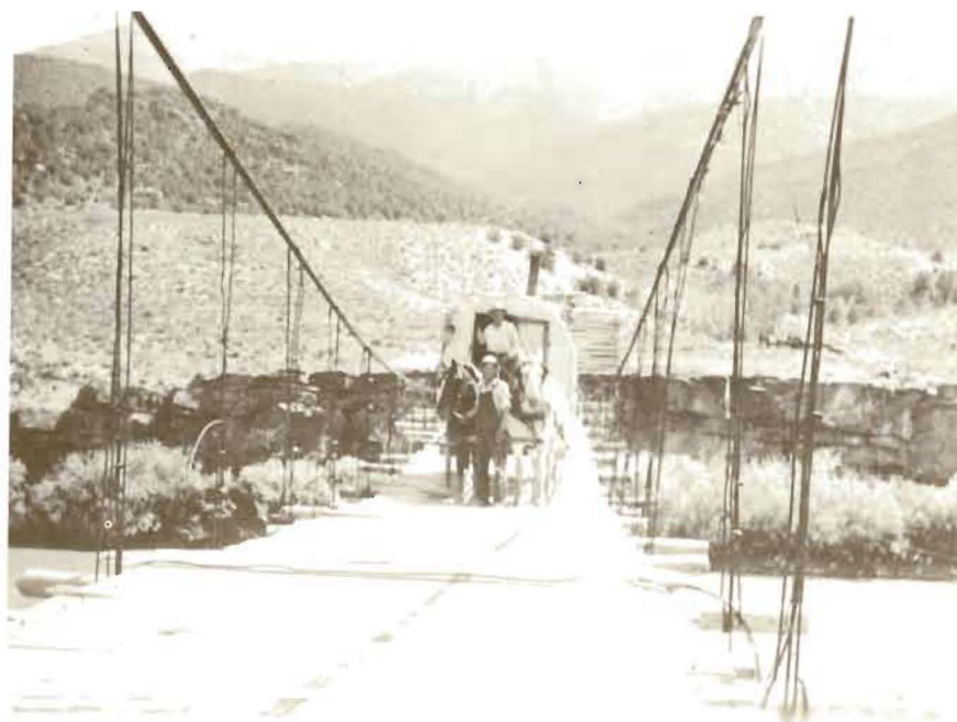
Brown's Park Swinging Bridge