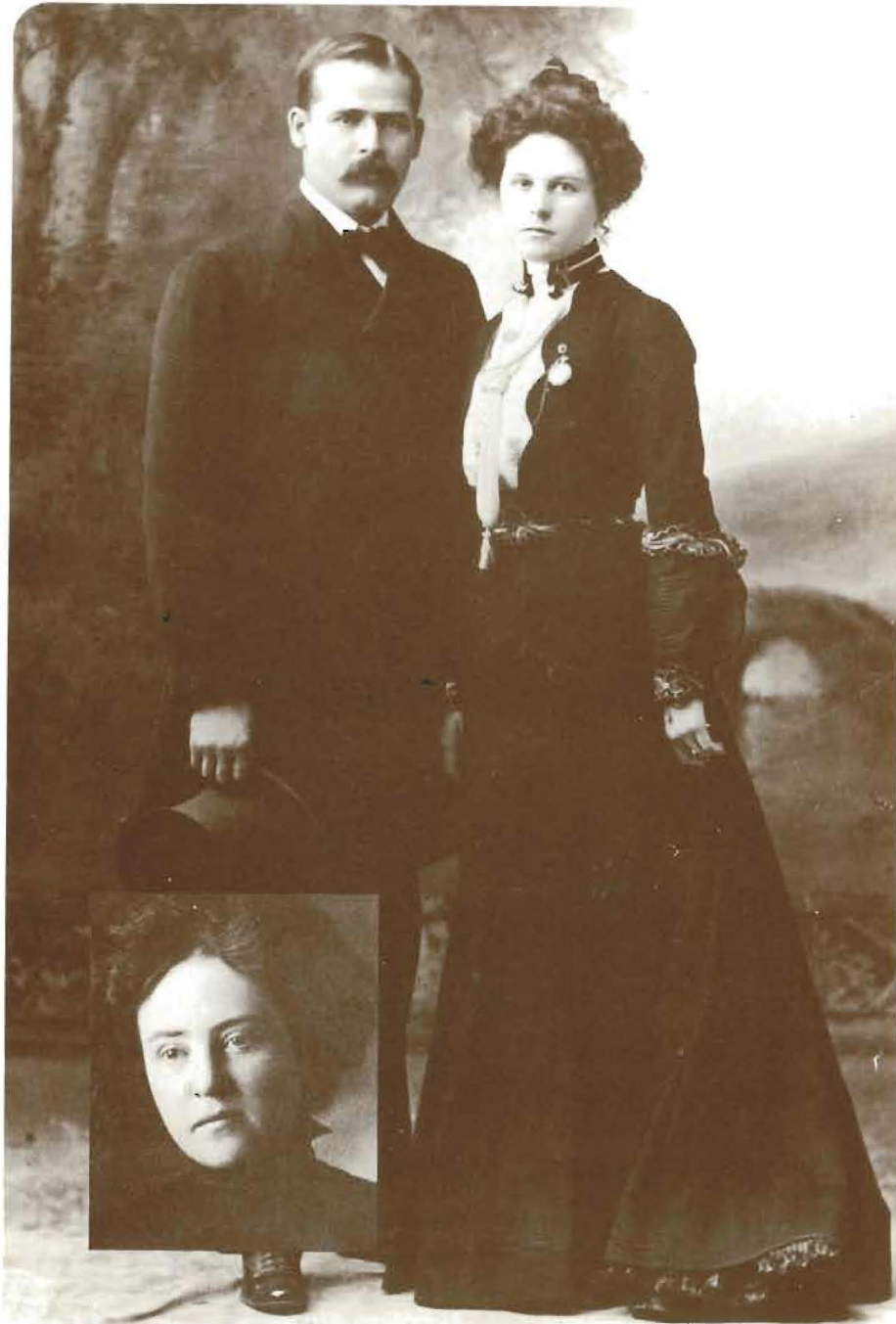
Etta Place Sundance Kid