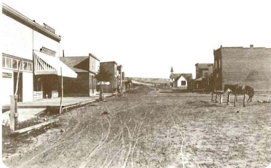
Craig, Colorado, Main Street